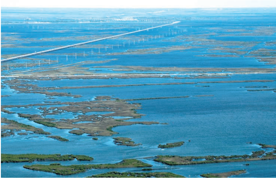
Figure 3. Elevated highways through the eroded landscape

How and why settlement continues to exist, even thrive, in this region are pivotal questions for our general interpretation of growth and inhabitation in areas of fraught environmental conditions coupled with valuable resources. This form of settlement has a particular makeup and pattern that is emblematic of its relationship with these forces. Thinking of this as a type of urbanization, rather than accepting these locations as rural, is useful for analyzing this condition. Not urban in form, rather in the sophistication of their infrastructure and connectedness to a global flow despite their physical isolation. Not urban as in dense population agglomerations, either, but a range of towns across a large territory that collectively constitutes one community. In this case, urban as a conception that provides a context for understanding the strength of these communities, how they're shaped in defiance of environmental and geographical conditions, and, ultimately, a way of interpreting contradictory development.