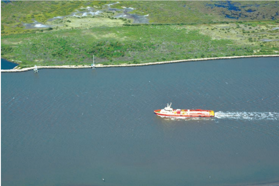
Figure 6. An industrial service and transport boat traversing a waterway