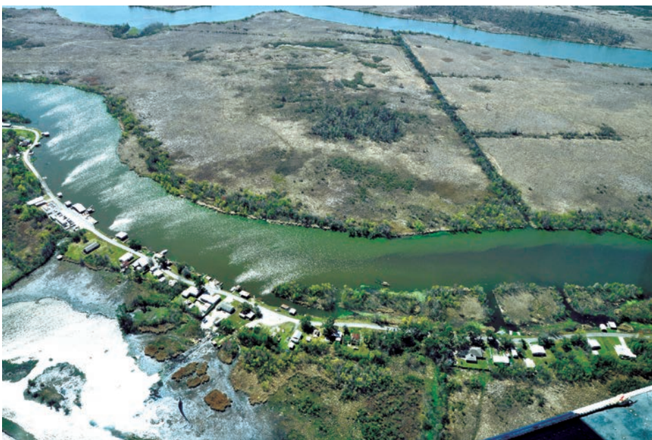
Figure 4. Housing and roadway morphing to the landform

How and why settlement continues to exist, even thrive, in this region are pivotal questions for our general interpretation of growth and inhabitation in areas of fraught environmental conditions coupled with valuable resources. This form of settlement has a particular makeup and pattern that is emblematic of its relationship with these forces. Thinking of this as a type of urbanization, rather than accepting these locations as rural, is useful for analyzing this condition. Not urban in form, rather in the sophistication of their infrastructure and connectedness to a global flow despite their physical isolation. Not urban as in dense population agglomerations, either, but a range of towns across a large territory that collectively constitutes one community. In this case, urban as a conception that provides a context for understanding the strength of these communities, how they're shaped in defiance of environmental and geographical conditions, and, ultimately, a way of interpreting contradictory development.