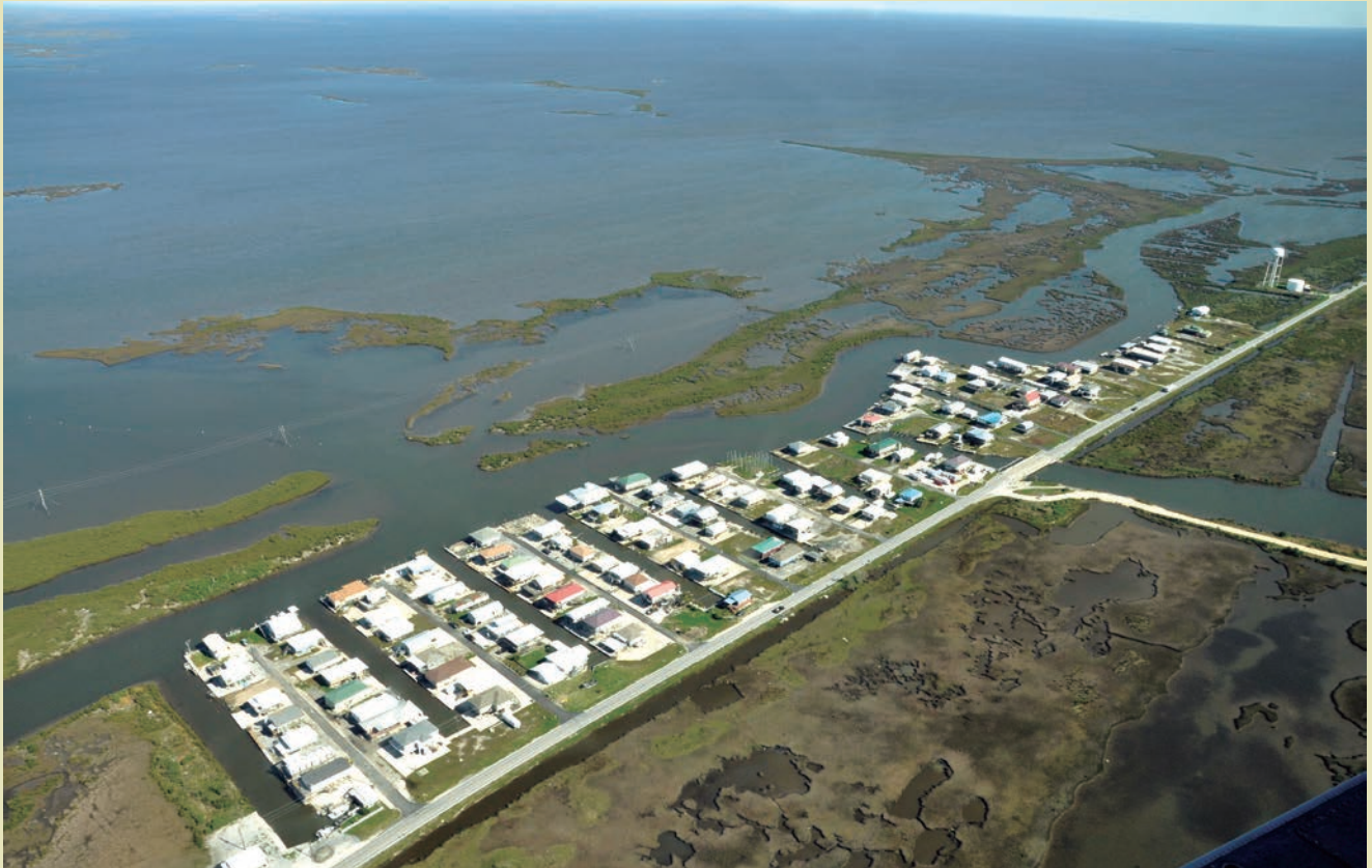
Housing development at the periphery