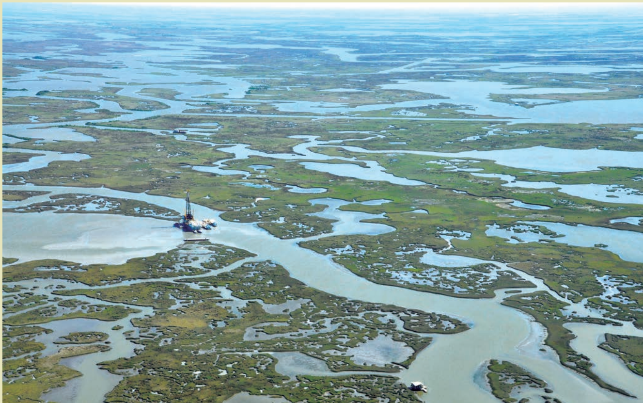
Habitation and industrial development coexisting in the wetland region

* This essay serves as a current summary of research being conducted by the author and Ann Yoachim that, as indicated by the general nature of what is presented here, is in its initial phase of theorization and is ultimately only a portion of work related to the topic of developed landscapes and habitation in conjunction with industrial production.