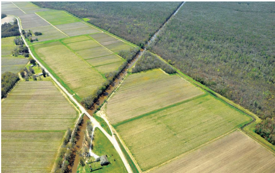
Figure 7. Overlay of industrial, agricultural and historic land organizations