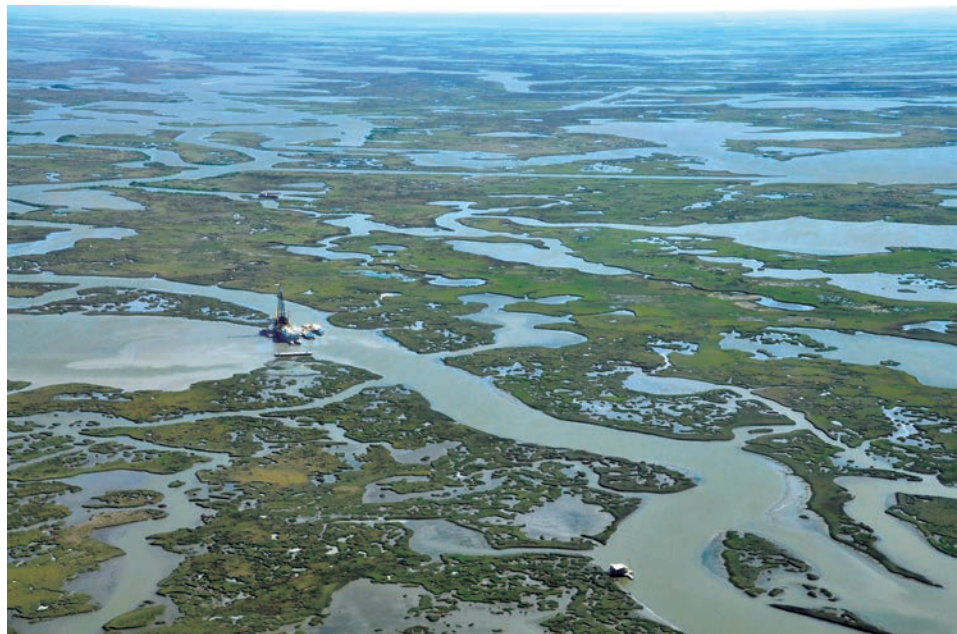
Figure 1. Habitation and industrial development coexisting in the wetland region

While studies proclaiming the importance of concentric urban nodes are common, our understanding and analysis of settlement patterns that are peripheral to these centers is limited at best. What is particularly interesting is when these zones are in fact the drivers of regional and global economies. Examining areas of this type provide insight into a form of settlement that is reflective of a rural beginning but has evolved through a process associated with economic drivers often disproportionate to the perceived value or role of the land. Looking at one region of the US, Southeastern Louisiana, provides an opportunity to explore this particular condition. The result is a projective evaluation of spatial settlement patterns as indicators of industrial development subverting the role of the environment and how this is shaping the way we make places.