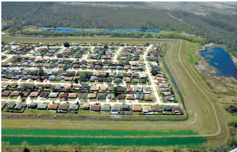
Figure 2. Housing pressed against a levee protection system

Meanwhile, a significant population has developed at historic settlement locations and within the wetland fabric. Ranging in size from tens to tens of thousands, these communities, villages, towns and cities collectively define an important zone of extended urbanization 2 . Often overlooked due to the dominance of New Orleans — the historic, concentric node — this network of settlements function as a supportive backbone to the extraction economy. Home to many of its workers and structures necessary to function in the region, these places are physical manifestations of the local and global connectedness driving the inhabitation of this precarious landscape.