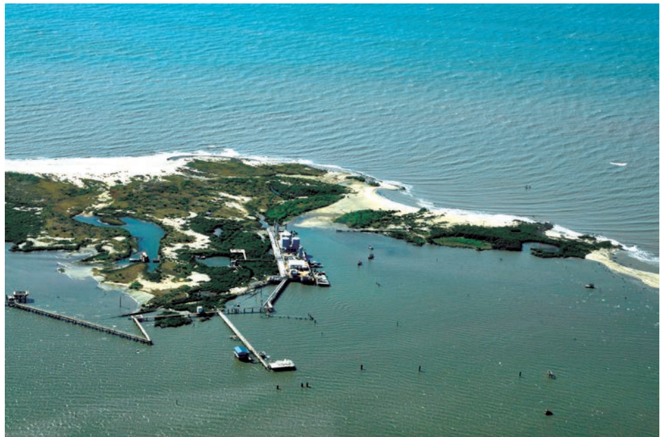
Figure 5. Industrial development affixed to a tenuous beachfront

As the economic forces increase in presence and expenditure of capital, governing decision are driven towards, if not by, the investing industries. Local governments lose control of what is theirs to control in an effort to capture or keep — contradictorily — the engines of the economy.