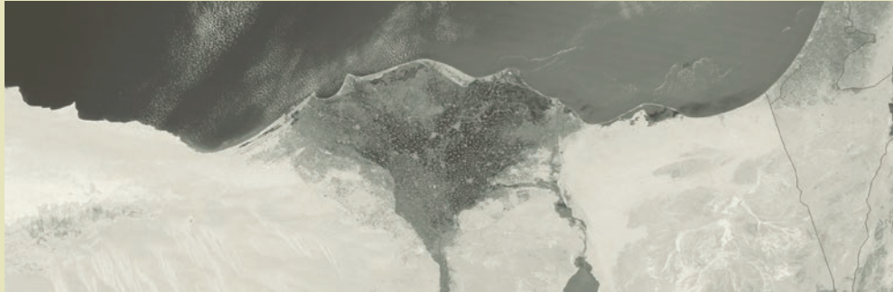
The Nile