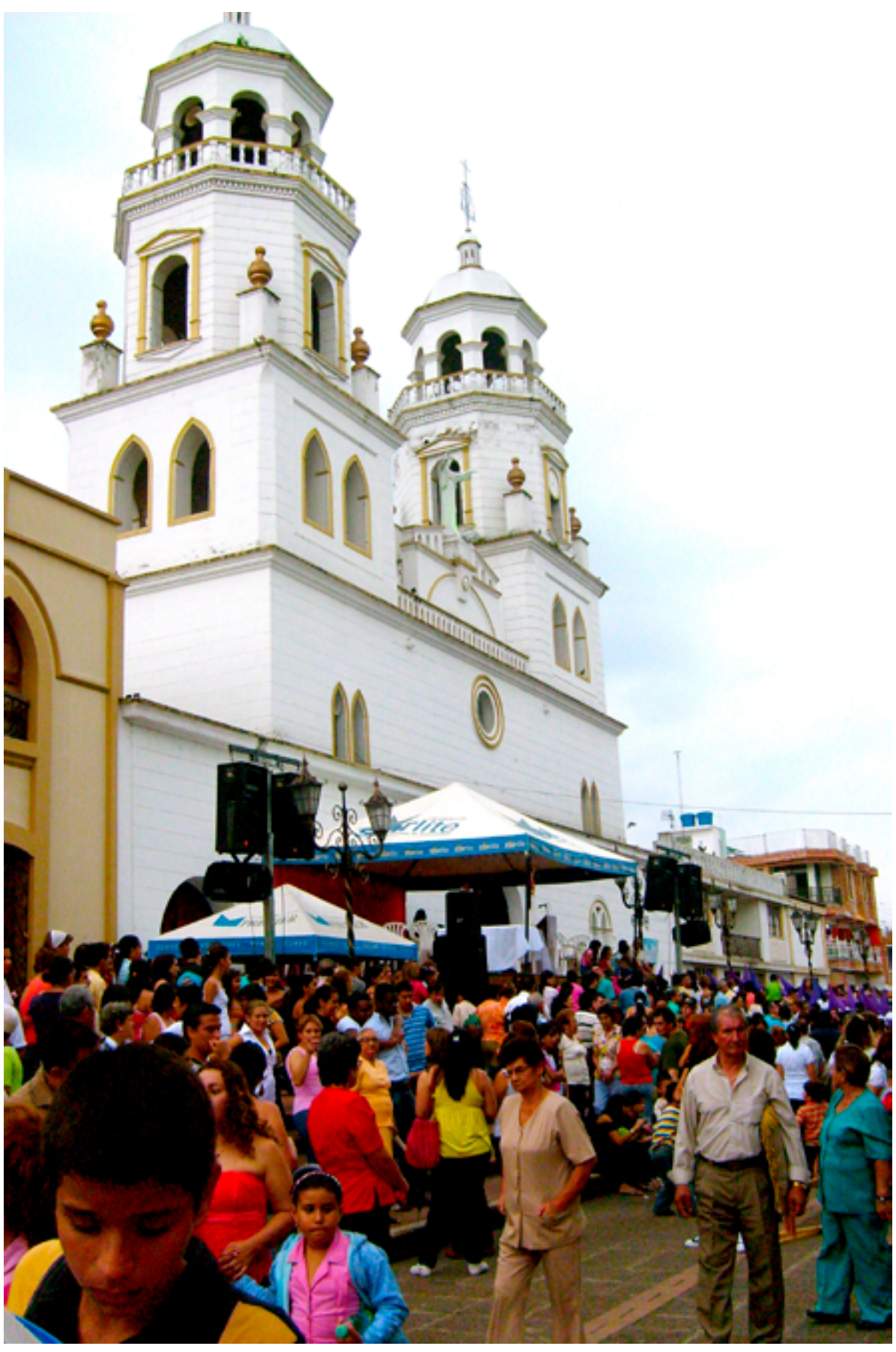
Parroquia San Juan de Nepomuceno – Floridablanca (Santander)